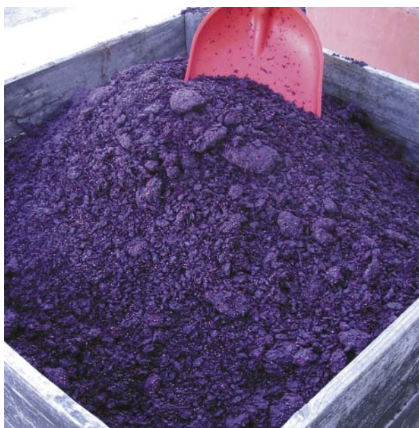
A load of red skins leaves the winery after pressing.

For the first time, we've kept all our Riesling grapes for ourselves, and we couldn't have chosen a better year to do it. Perhaps the most consistent variety we produce, every year